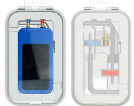
SPM-K1 Kit Contains: SPM-100 Meter (on top), Two Color Coded Magnetic Probes, Two 6' Sections of Latex Tubing, Brass Gas Fitting